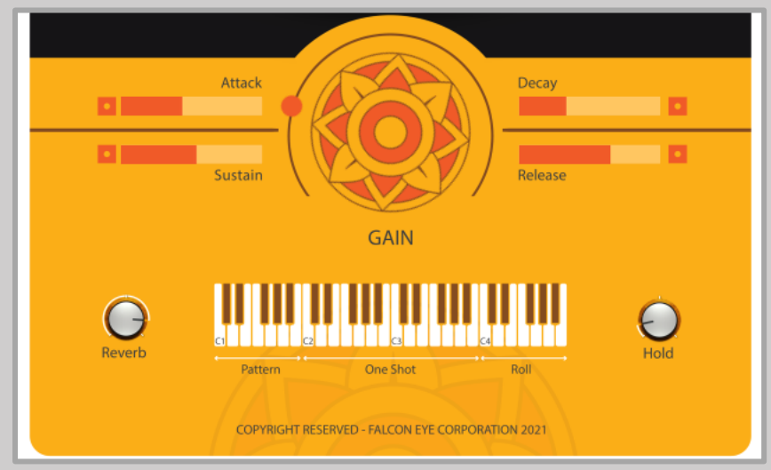
PANCHATHURYA V1.1 Main Volume Knob

• sets the volume level (increase or decrease in loudness of the audio output).